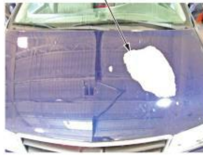
Example of paint peeling off the hood.