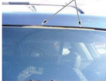
Example of paint flaking off the upper half of the left quarter glass.