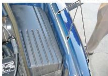
Example of paint peeling off the top of the left fender.

If you find paint peeling or flaking in any of the above areas, go to REPAIR PROCEDURE.