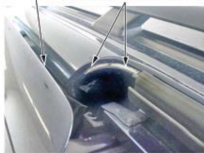
Example of paint flaking off of the roof, under the top edge of the sliding door.