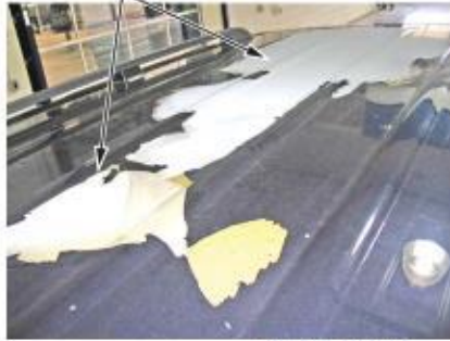
Example of paint peeling off in sheets from the roof.